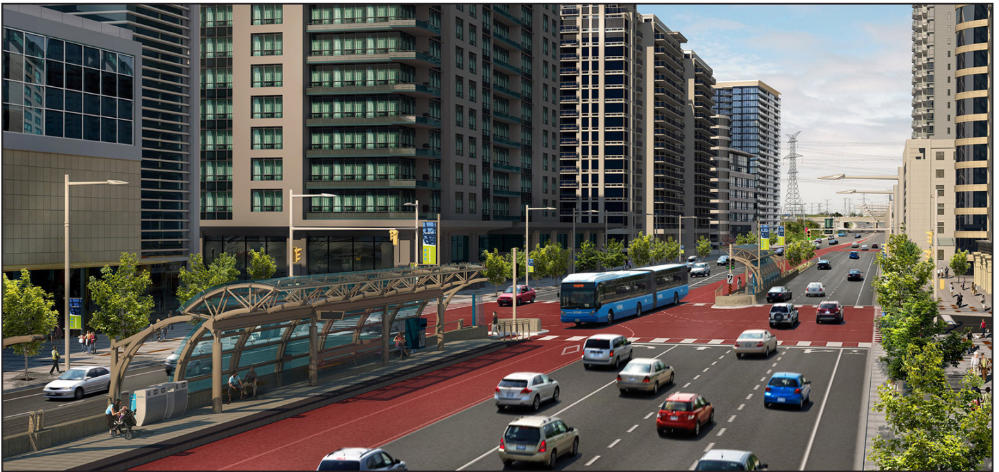
Figure 1: A rendering showing a portion of the Highway 7 redesign project located at the intersection of Chalmers Road. A rapid bus transit station and transit lanes reside in the middle of the roadway and are surrounded by travel and turning lanes as well as painted bicycle lanes. Pedestrian crosswalks have been enhanced to heighten visibility and awareness of drivers to improve the overall safety of the right of way.