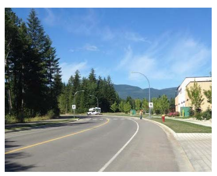
Murtle Crescent, developed according to the Road Cross-Section Bylaw, includes a sidewalk, bike lane, multi-use trail, lighting, a crosswalk, and street trees.

The district municipality of Clearwater (population 2,331) is located an hour and a half north of Kamloops. In 2013, it undertook a <u>study</u> on Road Network Rationalization and a Road Cross-Section Bylaw Framework. The community was engaged in a discussion about the connections between road design, active transportation and health outcomes, including through a mobile public open house that had residents moving from station to station on foot, by bicycle and on in-line skates. The result was a <u>Road Cross-Section Bylaw</u>, which establishes new street types based on surrounding land uses and types of user.