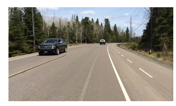
Arundel Street, south side bike lane faded, only one year after installation

toronto centre for active transportation