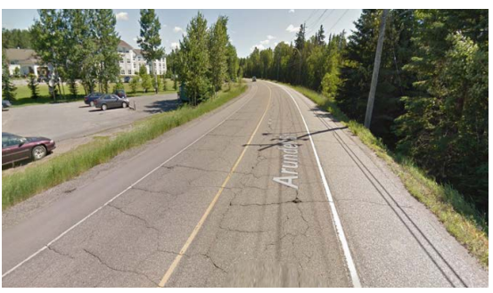
Arundel Street, before Complete Street transformation