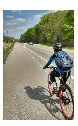
This paved shoulder with a buffer in Cambridge, Ontario, provides a link between two off-road recreational trails.

The data gathered may also point to areas where the road's performance is falling short of the anticipated outcomes, perhaps jeopardizing support for the project. In this case, adjustments may need to be made, as in the Thunder Bay case study below. Piloting an intervention with semi-permanent materials, for example by using planters and decking to widen a sidewalk and adding more patio space, can allow a municipality to test and perfect an idea, gather data, and build support before making the change more permanent.