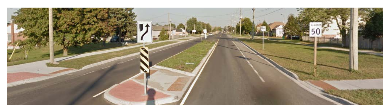
A pedestrian refuge island on Church Street, after the reconstruction

The community of Elmira (population 9,931) is located 15 minutes away from Kitchener-Waterloo, within the rural Township of Woolwich, which is part of the Regional Municipality of Waterloo, Ontario. In 2013, its main, regional road, Church St, was set to be reconstructed due to the deteriorated quality of its asphalt, insufficient storm-water drainage, aging utilities, and increased turning traffic. The road was designated a Rural Village Main Street in the Region of Waterloo's <u>Context-Sensitive Regional</u> <u>Transportation Corridor Guidelines</u>, meaning that active transportation and moving motor vehicles efficiently at an appropriate speed were automatically priorities.