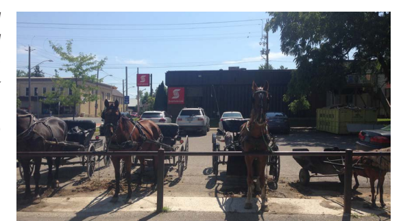
Horse and buggy tied up at a main street bank in Linwood, Ontario

While traditionally roads have been categorized on the basis of motor vehicle speed and volume alone (as arterial, collector, local, etc), the Complete Streets approach looks at land uses as well, and incorporates the surrounding context into roadway design decisions. In rural areas, context is particularly important, as a single regional road could pass through open countryside, natural areas, industrial land, and small towns, all the while maintaining its road class of arterial. Looking at the surrounding context as well allows a road to take on multiple categorizations along its length, allowing for a finer grained understanding and a more sensitive roadway design.<sup>18</sup> While wider sidewalks, benches and street trees may be called for on a main street, a multi-use path with a buffer may be appropriate on the outskirts of town, as motor vehicle speeds increase. Resources such as the Ontario Traffic Manual Book 18: Cycling Facilities can help with choosing appropriate infrastructure.