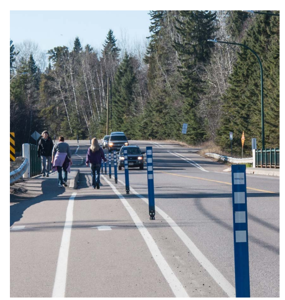
The modified design for Hudson Avenue, featuring an Active Living Corridor and painted buffers

From this experience, the design for Hudson Avenue was modified. The bike lane on the north side was maintained, but a painted buffer was added. On the south side, instead of a separate bike lane, a multi-use, Active Living Corridor was created instead including a 0.5m-wide buffer with reflective flexi-posts. While data collection is still underway, overall public response has been very positive.