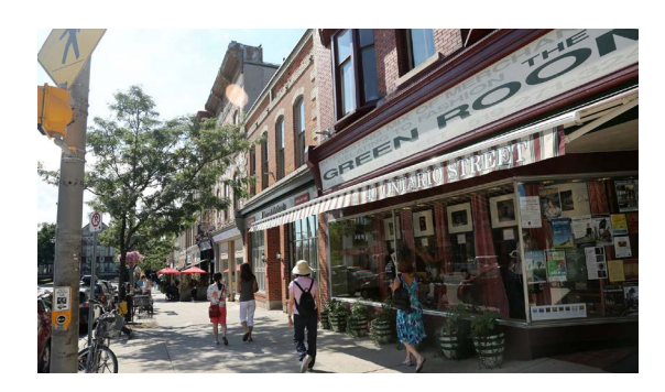
Downtown Stratford, Ontario, known for its theatre festival, offers a pleasant strolling experience for playgoers

Despite these arguments in favour, Complete Streets projects have met with resistance in some rural areas over concerns of increased capital and maintenance costs and loss of parking spaces in front of businesses. The long-term business case for a Complete Streets project should be well-articulated to gain the support of local businesses and elected officials.<sup>17</sup>